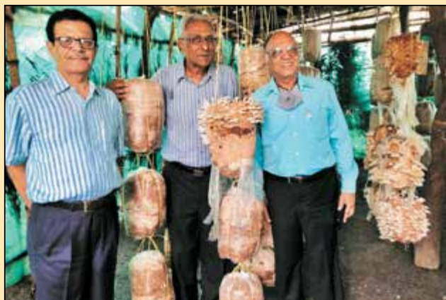
Mushroom Cultivation Plant room