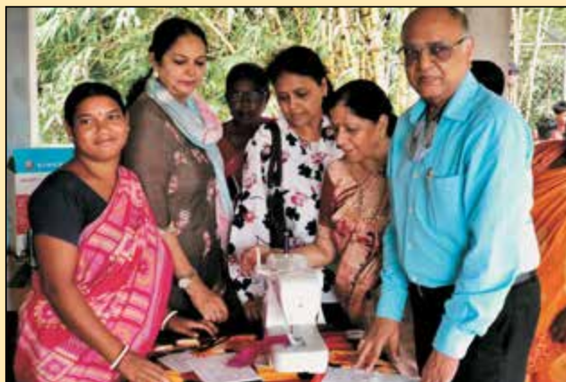
Electronic Sewing Machine is being handed over