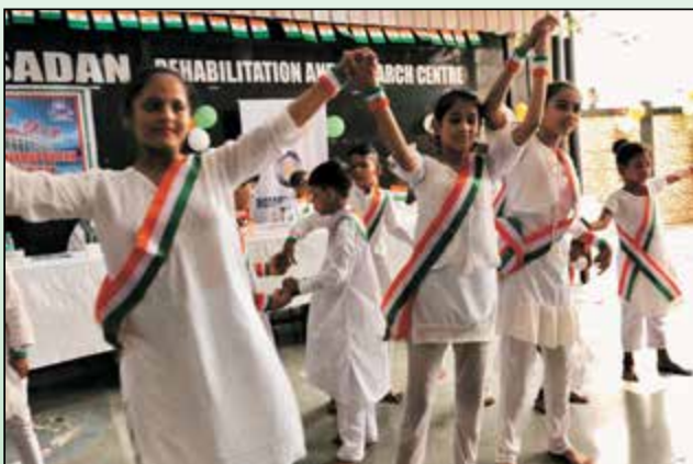
Crebral Palsy Children presenting dance