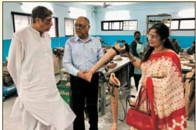
President showing the Artificial Limbs workshop