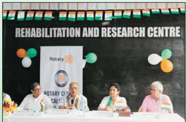
A view of the Head table