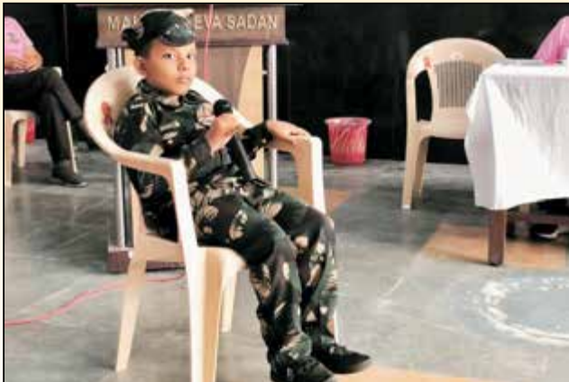
Rudranil-affected Crebral Palsy sang beautifully