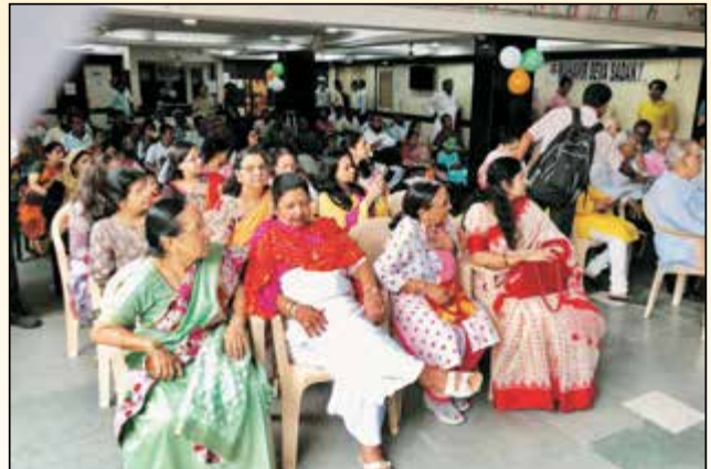
A view of audience