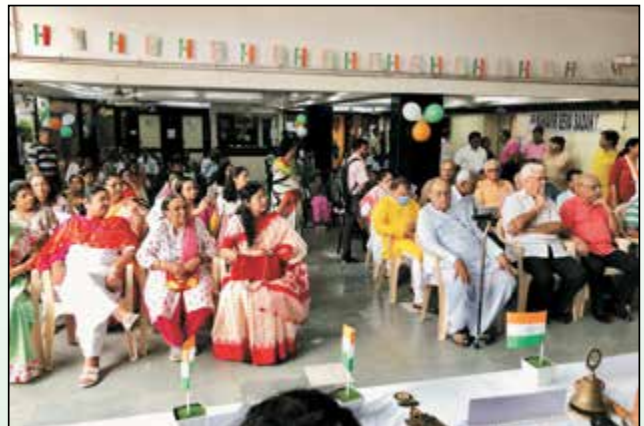
Another view of audience