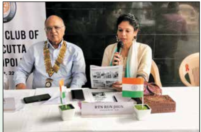
Acting Secretary making Club announcements