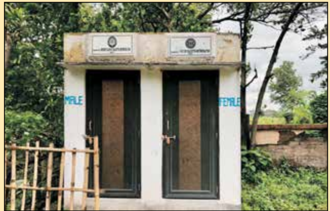
A view of Toilet provided by RCCM last year