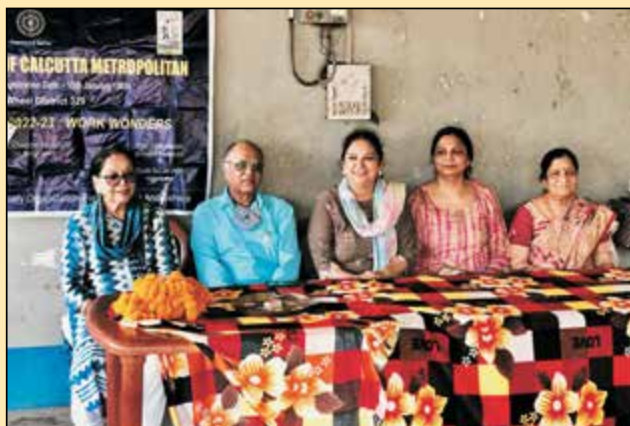
RCCM President Inner Wheel President addressing the audience