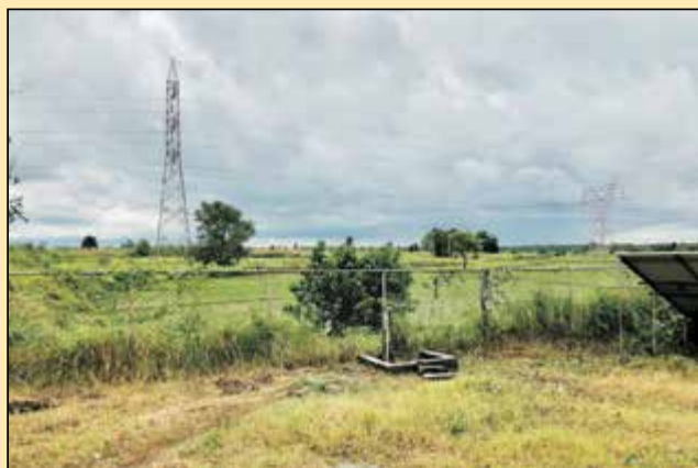
Greenery view of Nabadiganta Village